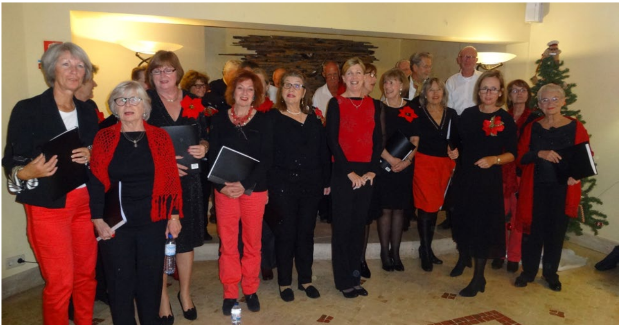
Sao Lorenzo Singers