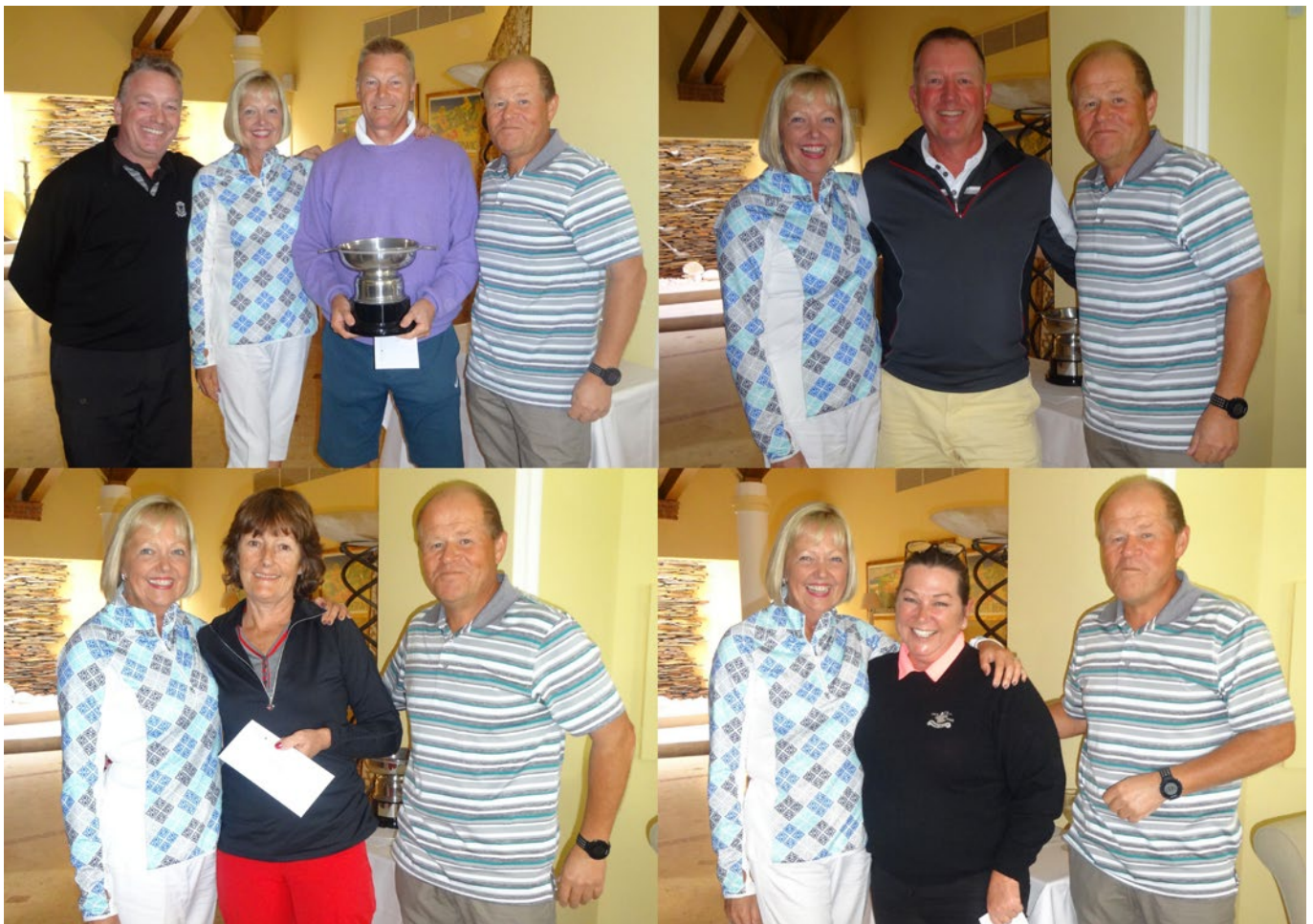
St Andrew's Day Memorial Trophy Winners

I, together with all the staff at Pinheiros Altos, would like to wish all of you and your families a very Happy New Year and a great golfing year!