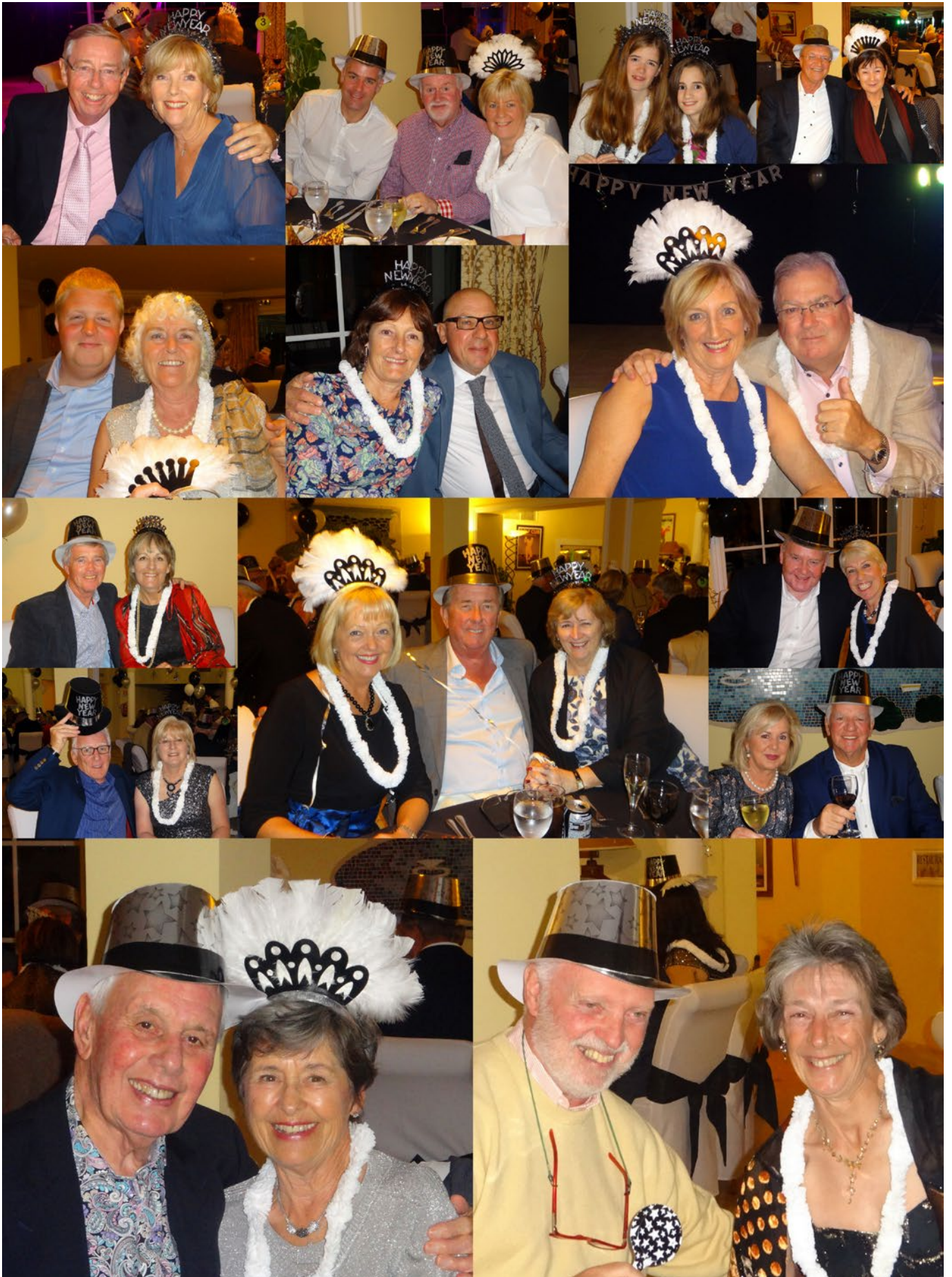
New Year's Eve Celebrations