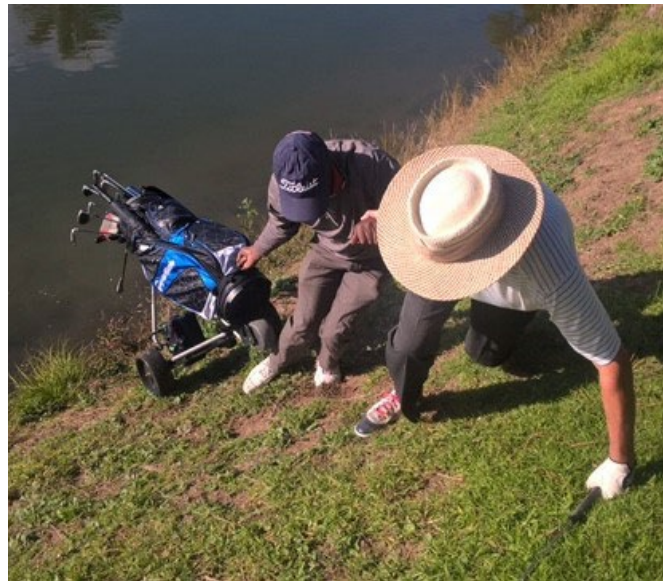
Pinheiros Altos Staff; Always Helpful Even in Difficult Situations