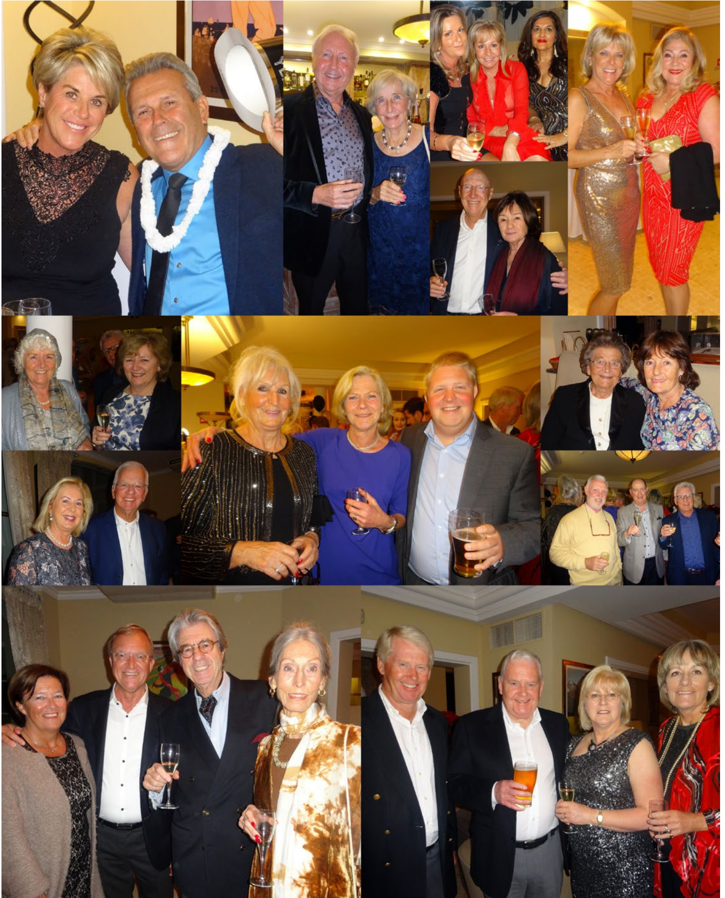
New Year's Eve Celebrations