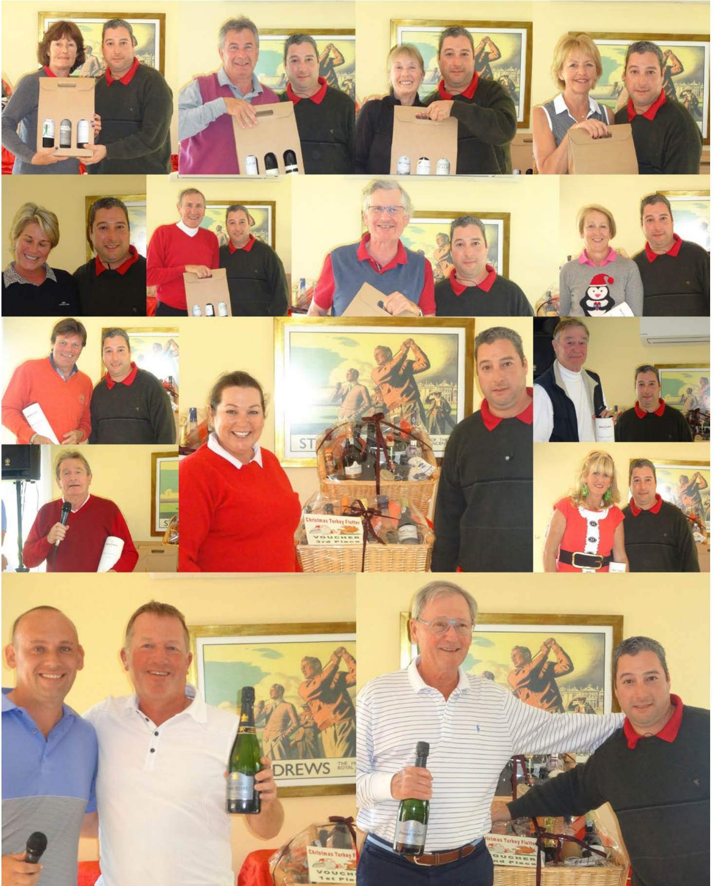
Christmas Turkey Flutter